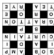
Solution to the crossword on page 11.