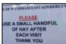
Intriguing special feature