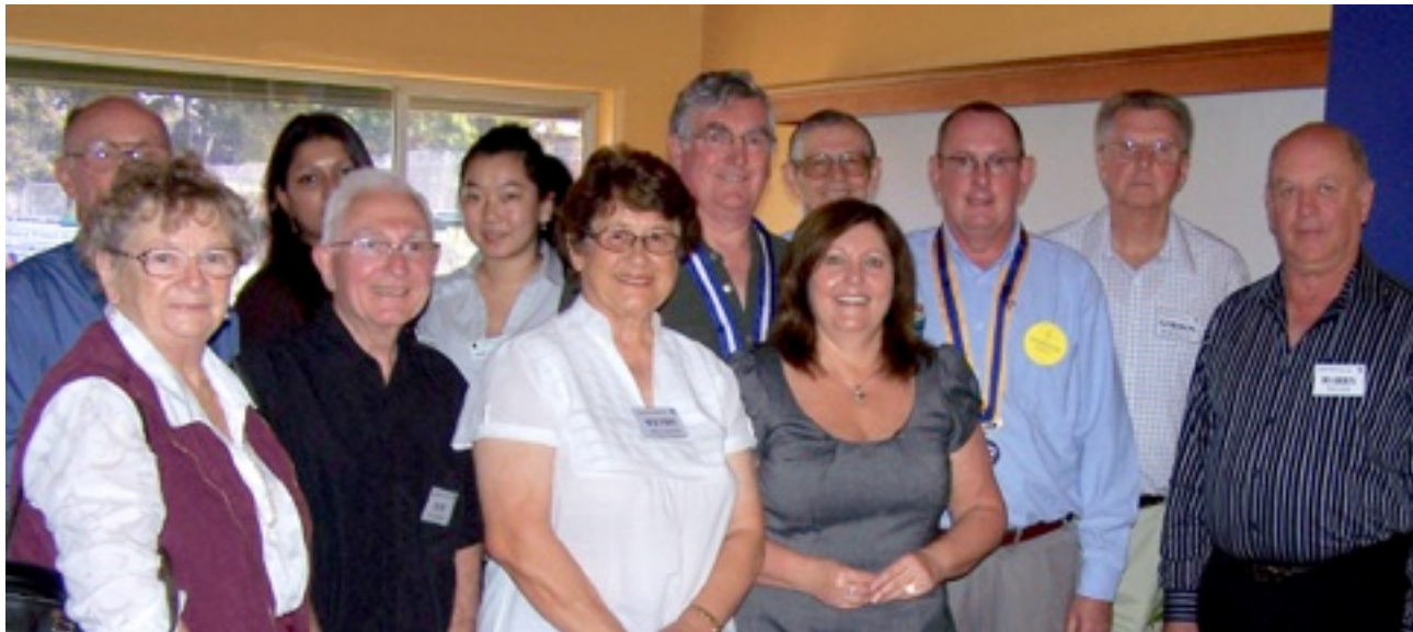
The first Committee