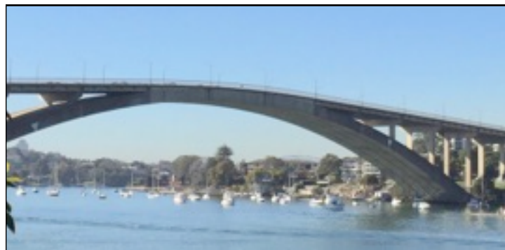
Gladesville Bridge, with Harbour Bridge behind

The recorder of this outing noted 'that the views had been amazing in taking in our wonderful city'. They then caught the bus from Victoria Road back to the city. A great day out was enjoyed by all. Bad luck all the other AMPC members who missed it.